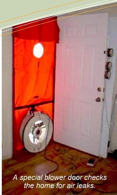
A special blower door checks the home for air leaks.

The main purpose of the Weatherization Program is to save energy. Saving energy cuts heating costs in the winter & cooling costs in the summer.